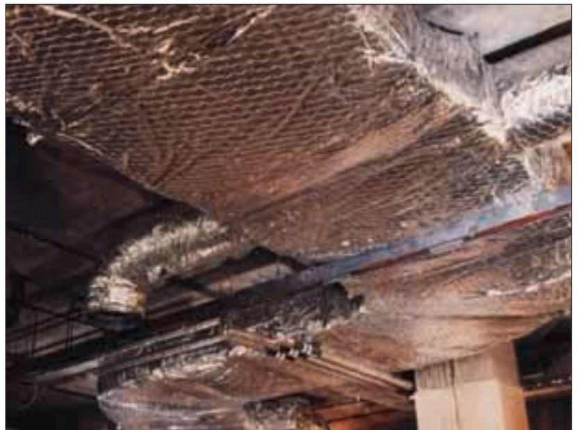
Rockwool Ductwrap used to thermally and acoustically insulate ducting

Ductwrap is a lightweight, flexible insulation roll faced with reinforced aluminium foil. Ductslab is a semi-rigid insulation slab faced with reinforced aluminium foil.